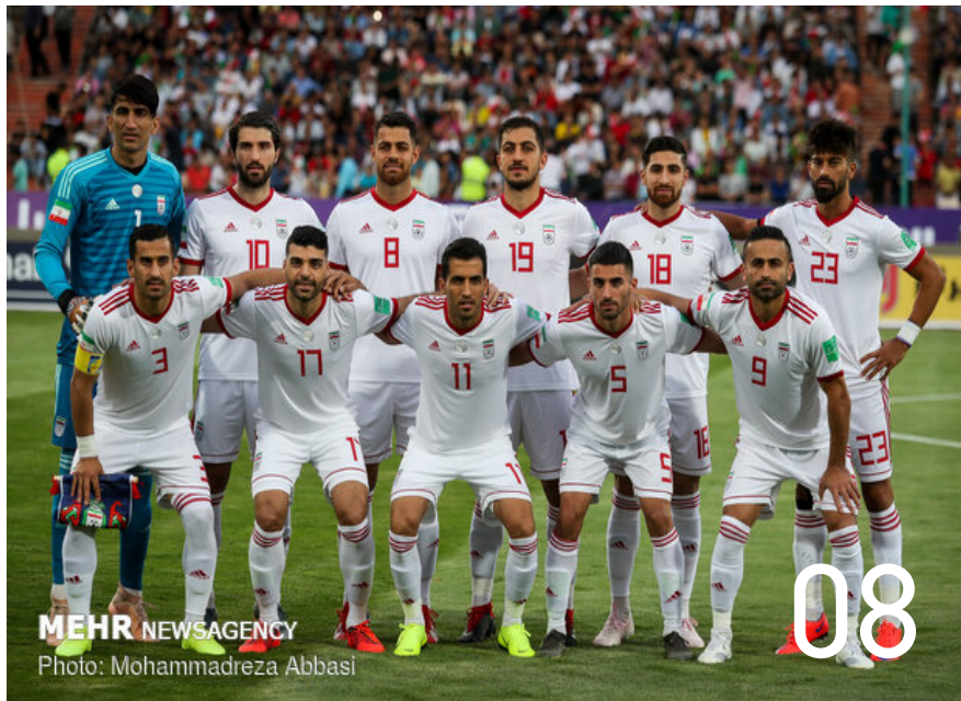
MEHR NEWSAGENCY Photo: Mohammadreza Abbasi